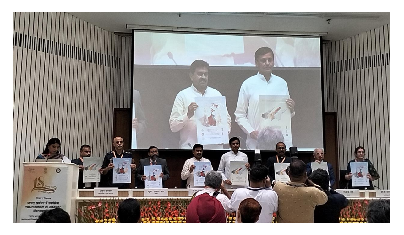
Fig 3 Release of AP & WB by Hon'ble Ministers of State, Ministry of Home Affairs, Sri Nityanand Rai and Sri Ajay Kumar Mishra

Kumar Mishra during the 18<sup>th</sup> formation day (28 Sep 2022) of NDMA at Vignan Bhavan, New Delhi. Glimpses of the release function are shown in the figures 3 to 5.