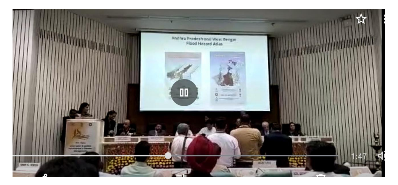
Fig 4. Video screened during release of the atlases highlighting the technical aspects in preparing the flood hazard atlases.

Fig 3 Release of AP & WB by Hon'ble Ministers of State, Ministry of Home Affairs, Sri Nityanand Rai and Sri Ajay Kumar Mishra