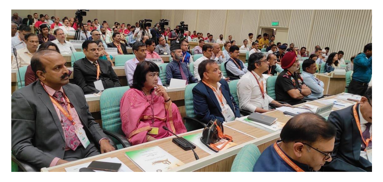
Fig. 5 Other dignitaries present during the release occasion on NDMA formation day